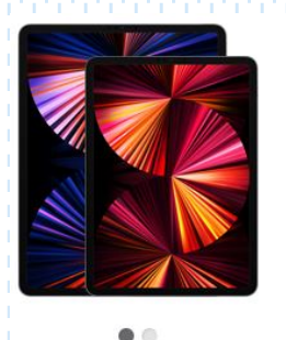
iPad Pro The ultimate

It is important to have a current iPad so that it can connect to our school network, can AirDrop, AirPrint and is able to update to the latest iPadOS (operating system iOS 16.1.1) so that it is able to run the most current apps and features. Here is a link to the most current iPads https://www.apple.com/au/ipad/compare/